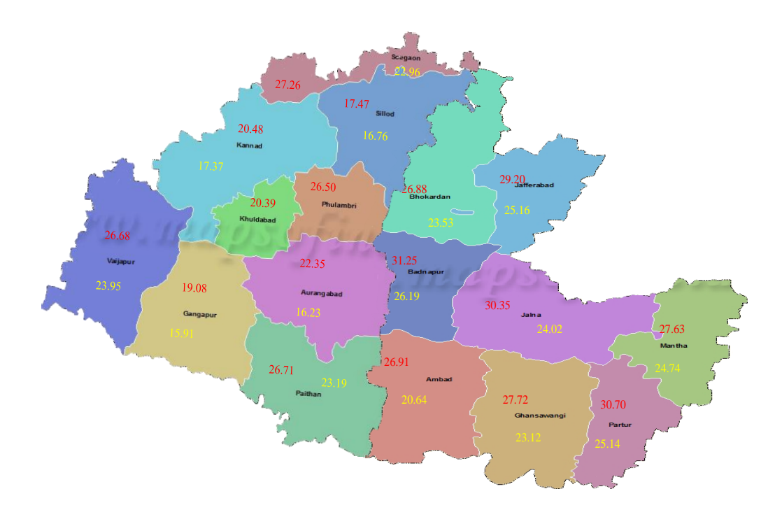
Fig.1 Leaf blight disease incidence and intensity recorded on mung bean from the two major mung bean growing districts Aurangabad and Jalna of Maharashtra state, India.

The lowest disease mean incidence was found in Sillod tahsil (17.47 %). In case of per cent disease intensity it was ranged from 1.23 to 35.56 per cent. Throughout the Aurangabad district the maximum disease